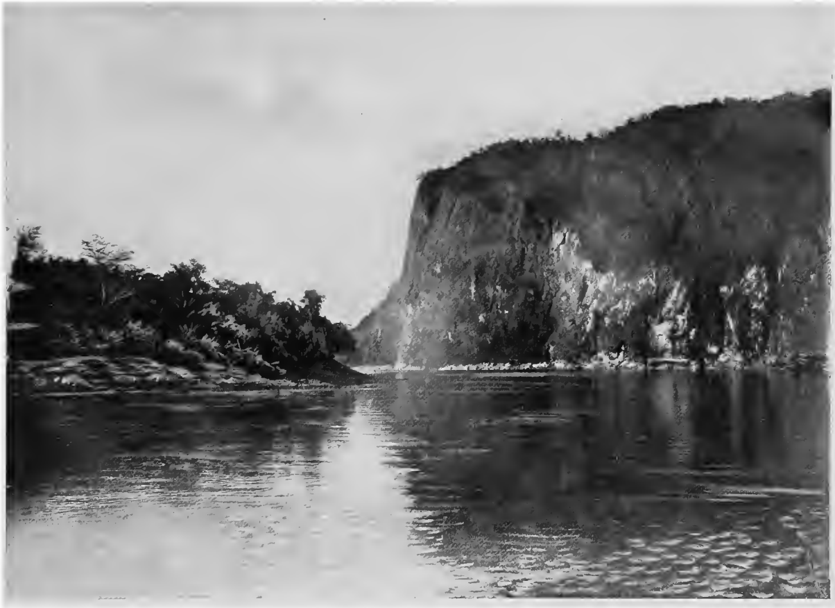
The Second Defile, Irrawaddy, Upper Burmah